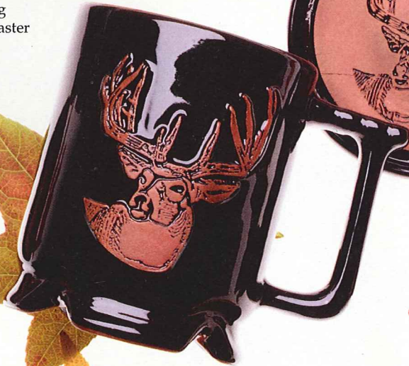
265DR-Deer Coaster DRC1-Deer Mug