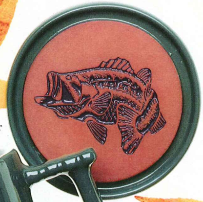
265BS-Bass Coaster BSC1-Bass Mug