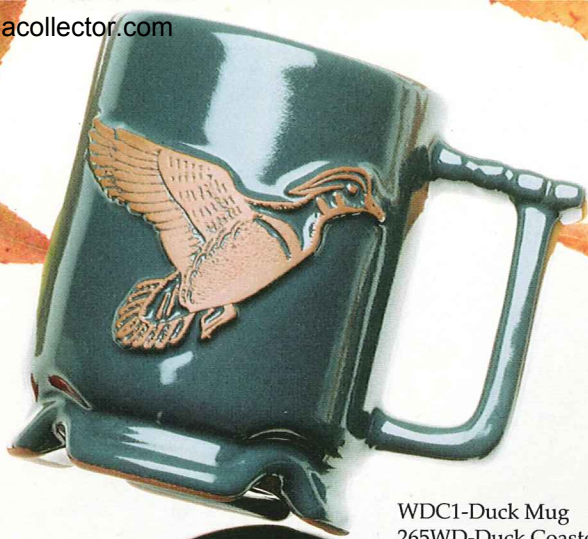
WDC1-Duck Mug 265WD-Duck Coaster