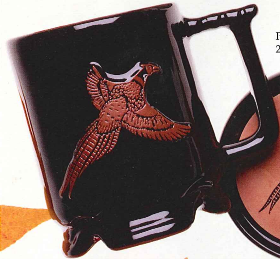
PHC1-Pheasant Mug 265PH-Pheasant Coaster